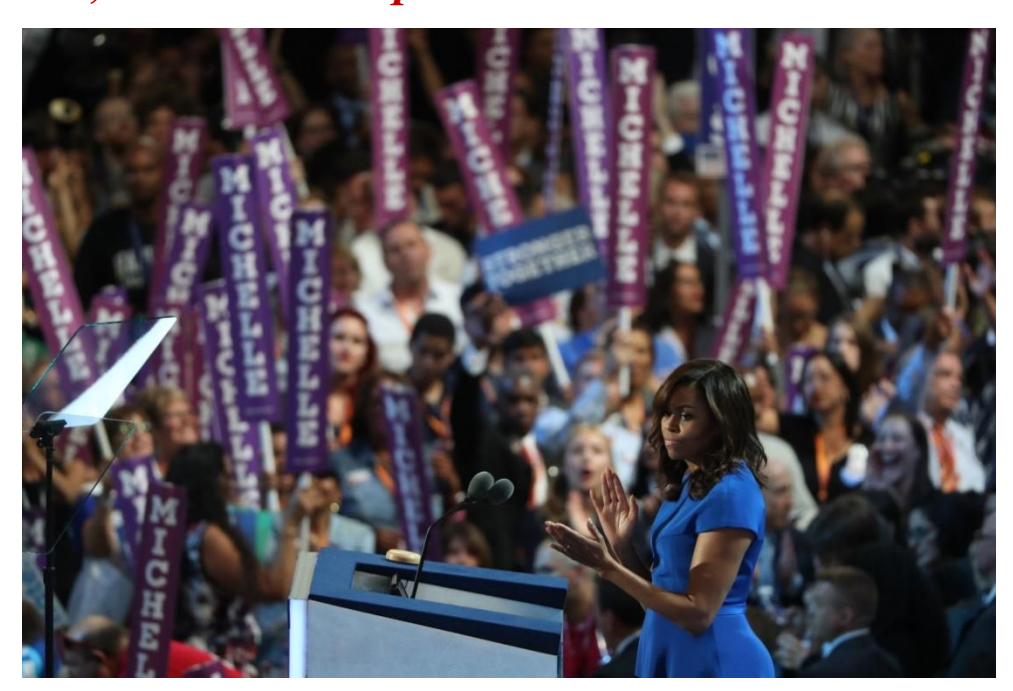
Yes, Slaves Did Help Build the White House

From the 1950s and 1960s, with the Supreme Court decision in Brown v. Board of Education - to the 1990s, African Americans have fought and endured institutional racism, discrimination, and oppression unlike any other group in the United States. They have persevered amid inhumane assaults and in the face of adversity. They have shown remarkable resilience for living through the eras of slavery, Jim Crow segregation, and racial terror. Through their struggles, they have made momentous contributions toward advancing the civil rights of all Americans and the quality of their lives against ponderous odds (Chima, 2014).