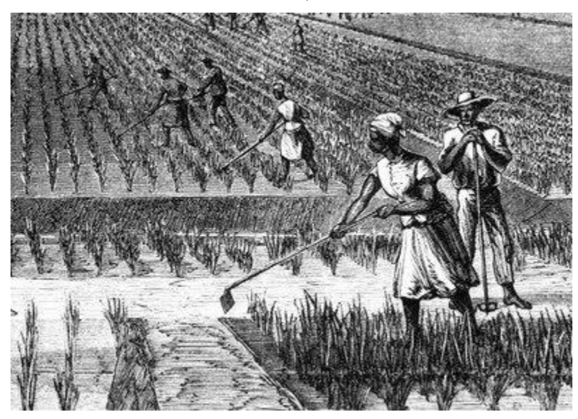
African Slaves' Contribution in Building America

Within a few years, hundreds of thousands of slaves were crossing the Atlantic each year. Known as the "Middle Passage", the voyage from Africa to the United States was one of massive, forced migration. It involved overcrowded ships, harsh conditions, disease, suicides by jumping overboard, and maimed hands and feet because persons were chained to one another. It has been estimated that 5 to 20 million Africans were enslaved in the United States before the Emancipation Proclamation. The two and a half centuries of slavery as an economic institution caused the displacement and death of over 100 million Africans, including those who died during the passage (Chima, 2014; Leashore, 1995; Dixon, & Wilson 1994).